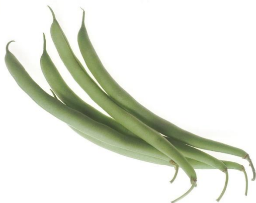
Las judías verdes