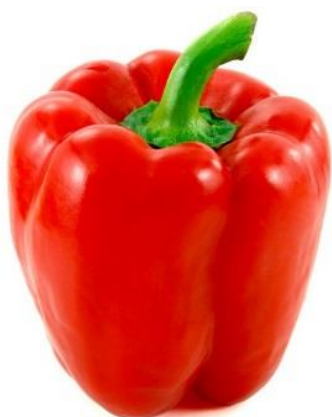
El pimiento rojo