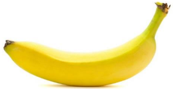
La banana o el plátano