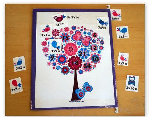
Multiplication by 3s File Folder Game