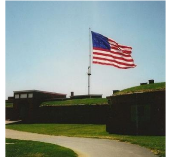
Fort McHenry where the flag flew during the War of 1812

O say can you see by the dawn's early light, What so proudly we hailed at the twilight's last gleaming, Whose broad stripes and bright stars through the perilous fight, O'er the ramparts we watched, were so gallantly streaming? And the rockets' red glare, the bombs bursting in air, Gave proof through the night that our flag was still there; O say does that star-spangled banner yet wave, O'er the land of the free and the home of the brave?