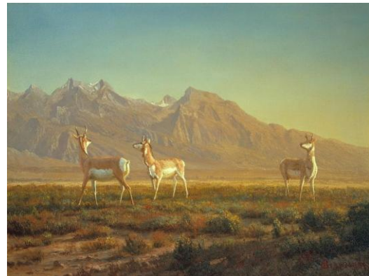
Paintings by the American painter, Albert Bierstadt